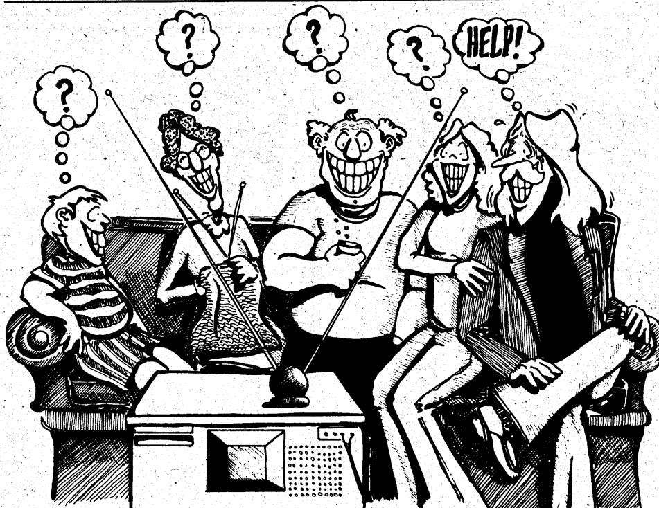
THE 100 DAYS OF JIMMY CARTER

You can go with a winner - free enterprise, which made America a land of opportunity - or you can side with socialism and watch your country go down the drain. It's up to you. And why not?