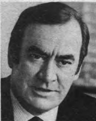
Hugh Carey (D)

In this year's gubernatorial election, the voters have one basic question to ask themselves. Do we want more of the same, or do we want a change? Malcolm Wilson, Nelson Rockefeller's hand-picked successor, is nothing more than an extension of Nelson Rockefeller, and all that he stood for.